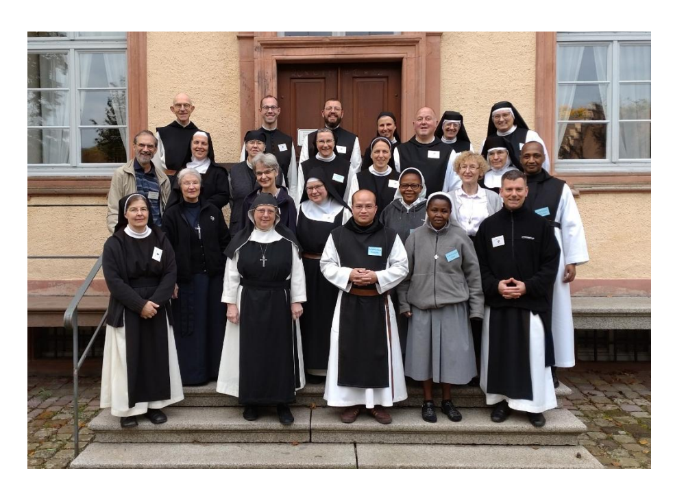
The texts of the presentations can be found in attached files, in French.

«Commitment is the 'yes', a human word that opens the door to the Word. Commitment marks a passage in a process of incarnation. Vows are an act of love».