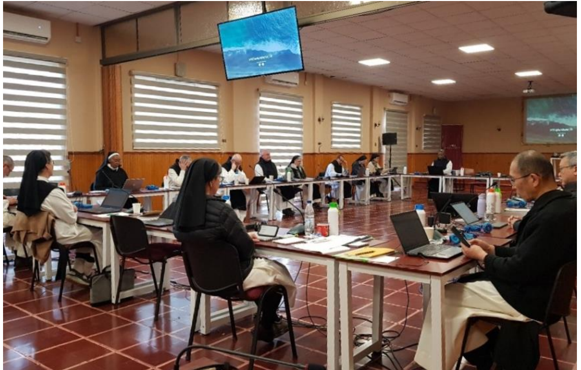
The Central Commission meeting, Chile